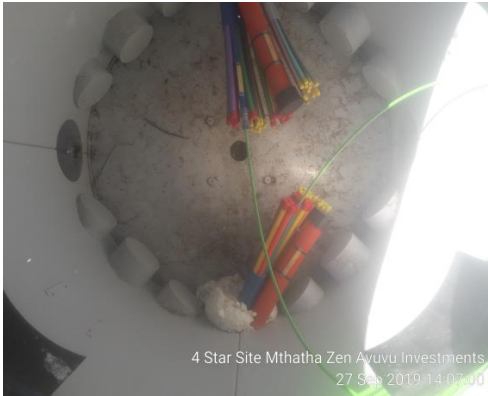
4 Star Site Mthatha Zen Avuvu Investments 27 Sep 2019 14:07:00