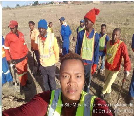
4 Star Site Mthatha Zen Avuvu Investments 03 Oct 2019 07:30:53